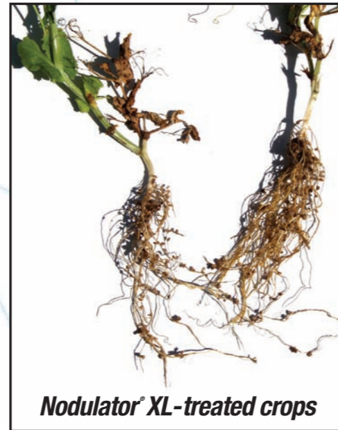
Nodulator® XL-treated crops